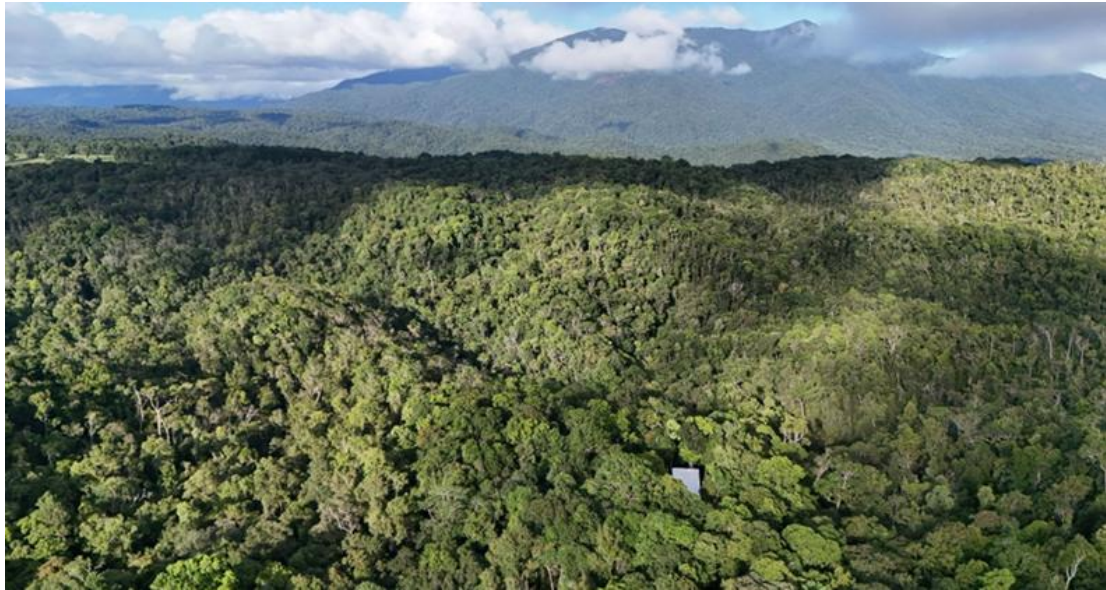
Wooroonoonan National Park – The tin roof marks Roberta and Paul's home

Our focus has been on regenerating forest habitat. Maintaining habitat provides home for wildlife. Many insects and mammals are under threat. A severe heatwave in 2019 was very detrimental – and scientists and landholders are not seeing a resurgence. The little environmental funding there is goes into needless academic study to quantify what landowners and citizen sciences have already observed, or expensive breeding programs established at zoos. Often all that is needed is to reduce speed limits through wooded areas – as is done in Canada - or reduce feral predator through the use of cat-proof fencing – as is done in New Zealand. Translocation of both plants and creatures from one area to another has been consistently banned by Departments of the Environment but there is a growing sense that this is essential with rising temperatures. There are moves to make land above 800 meters protected areas so creatures requiring cooler habitats have somewhere to go.